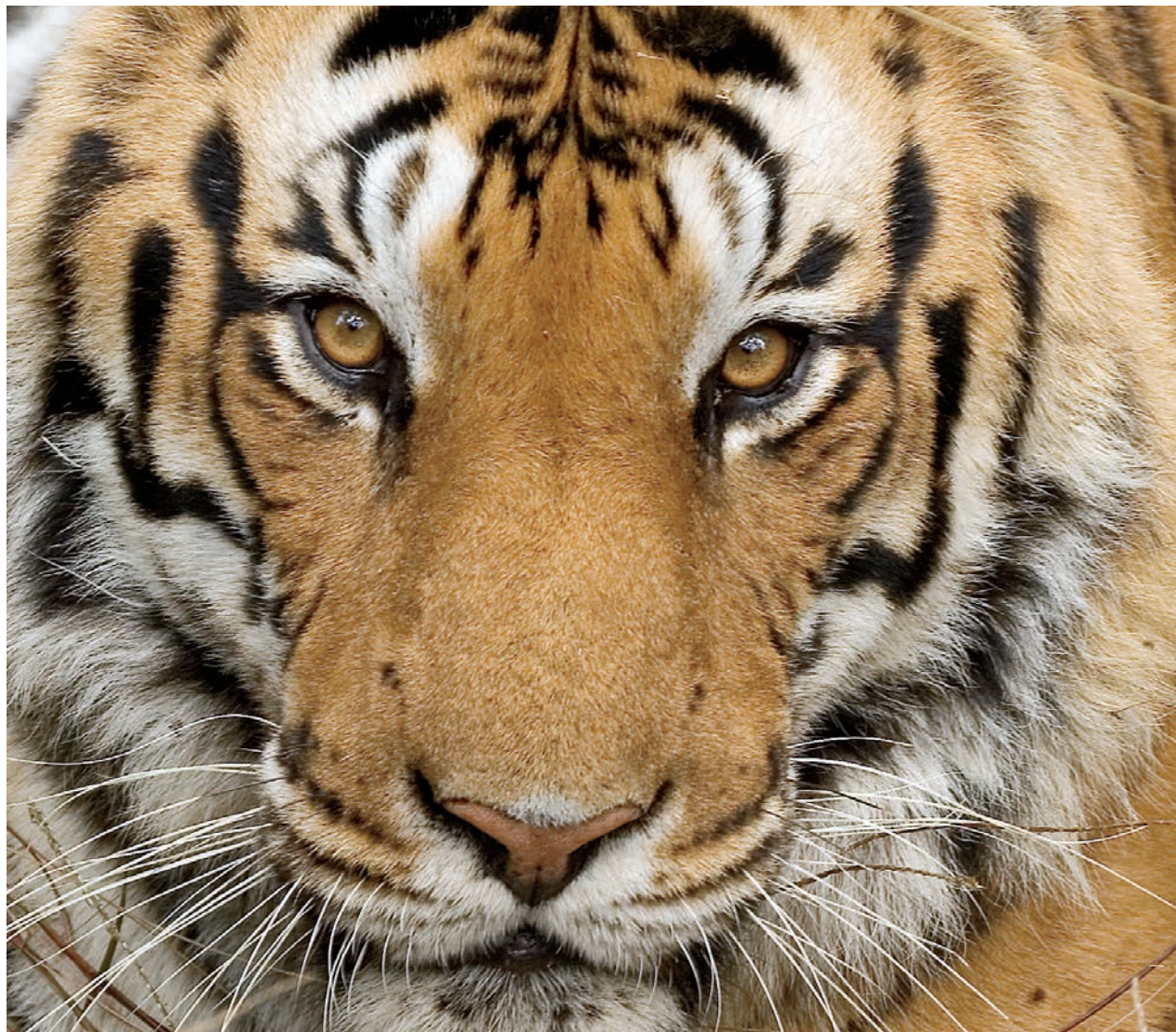
Tiger, Kanha National Park, India